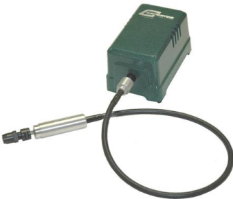
Model 27G shown with Optional P/N 1939D Flexible Shaft Assy