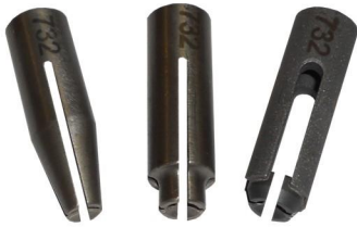
Hardened Bullet, Steel & Carbide Stripping Inserts